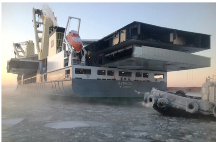
Icy start in Finland: Cargo with 16 m overhang

It is the third tallest hotel in the world, located on an artificial island, it has 202 bedroom suites with a size of up to 780 square meters and owns a helideck – the