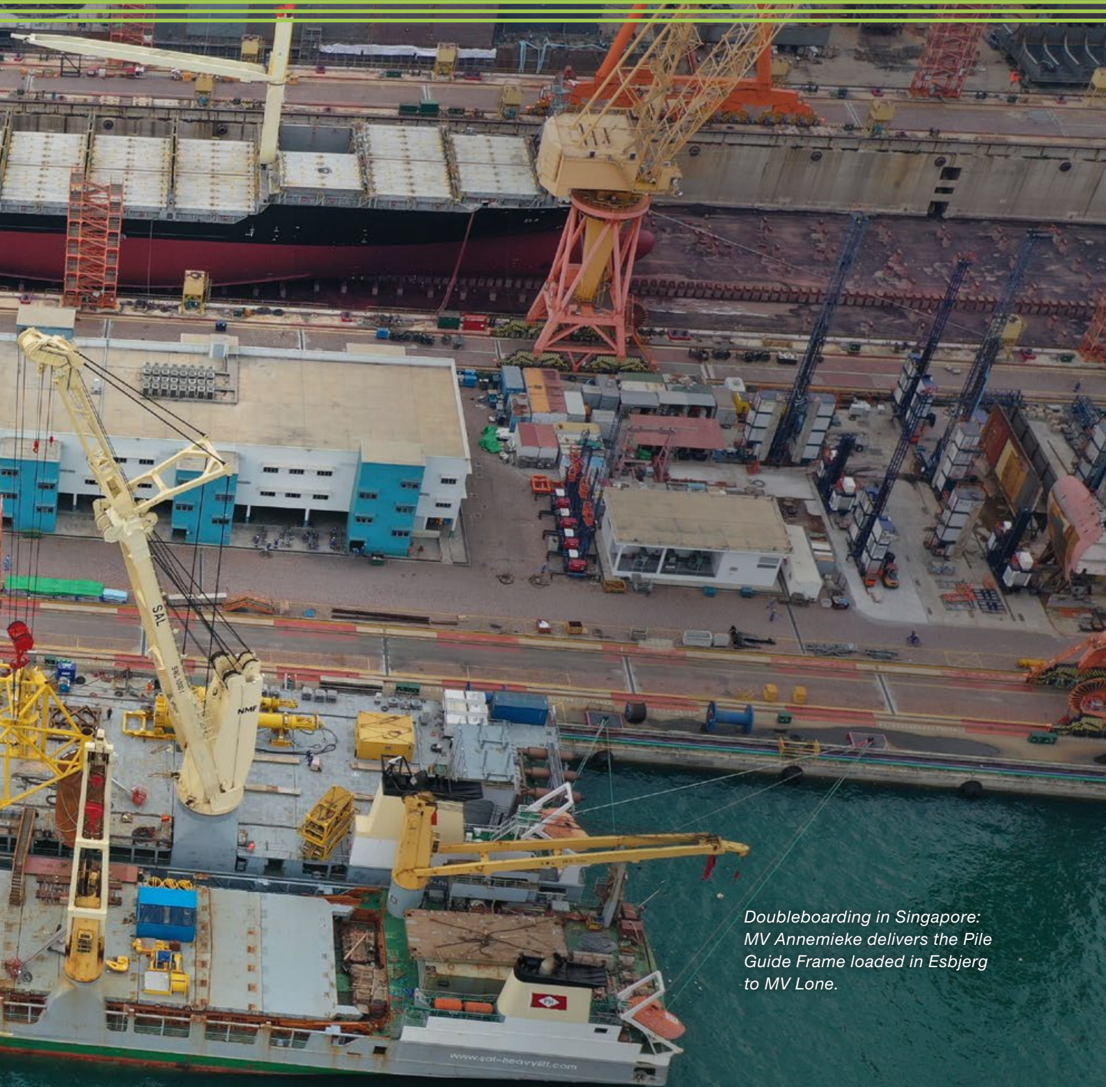
Doubleboarding in Singapore: MV Annemieke delivers the Pile Guide Frame loaded in Esbjerg to MV Lone.

It took four vessels to mobilise one for this amazing offshore project. 2019 proved to be an important year for SAL Heavy Lift when it came to offshore projects. The greatest highlight was our involvement in a Taiwanese offshore pile load test project for an offshore wind farm. This project took more than our best efforts and engineering capabilities – it also required ingenuity and a significant crane modification to achieve our goal.